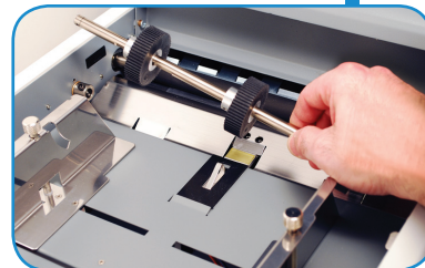
Removable Feed Wheels