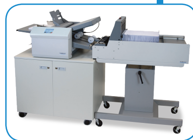
FD 386 in-line with optional V-Stack36i Vertical Stacker, multi-sheet feeder, stand and cabinet

Formax - New Hampshire, USA www.formax.com