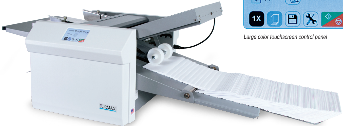
Large color touchscreen control panel

The Automatic FD 386 Document Folder offers any business, church, school or print-for-pay center quick, easy set-up, and the versatility to complete a variety of fold jobs in minutes. Jobs are completed exceptionally fast with the FD 386, folding up to 17,000 pieces per hour! Fully automated fold plates provide one touch set-up of the 18 pre-programmed fold settings or for choosing one of the 27 custom folds that can be stored into memory. In addition, the full-color touchscreen control panel makes the FD 386 extremely easy to use with a step-by-step user interface that is second to none.