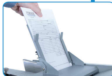
Optional Multi-Sheet Feeder